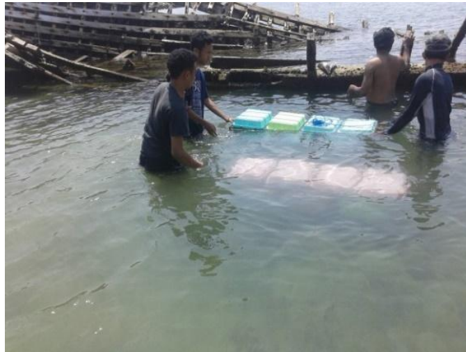
Figure 3. Positioning the containers with abalone larvae.