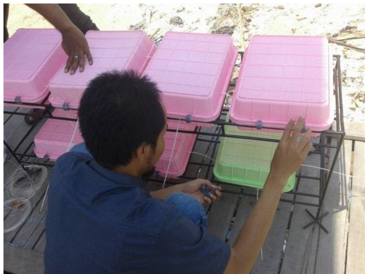
Figure 1. Abalone Rearing Containers.

A container with Abalone Juvenile larvae stocking density of 30 pcs/container (Figure 2).