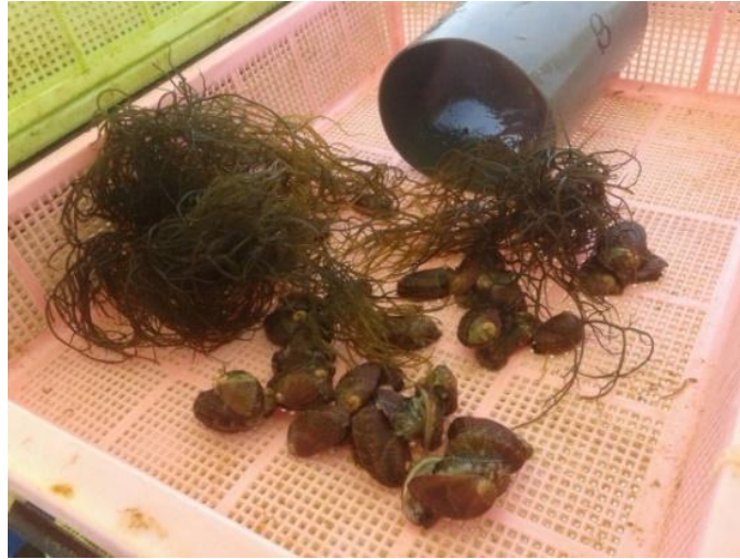
Figure 2. Abalone larvae were stocked in the container.