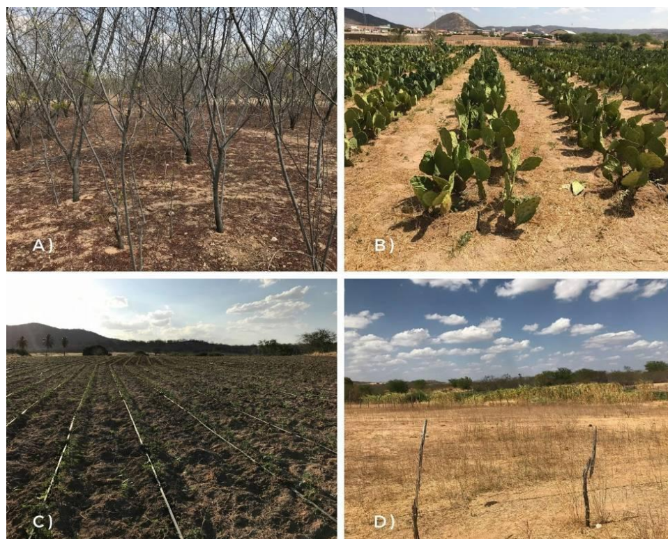
Figure 2. Land uses studied. A) Open Native Caatinga (ONC); B) Treated Sewage Effluent Irrigation (TSEI); C) Surface Water Irrigation (SWI) and D) Traditional Rainfed Agriculture (TRA).