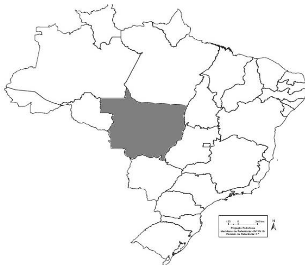
Figure 1. Geographical location of the state of Mato Grosso in Brazil.

( https://prodwww-queimadas.dgi.inpe.br/bdqueimadas/ ). Hospitalization data were obtained from the Unified Health System Computer Department (Datusus) related to cardiovascular diseases referring to those belonging to the International Classification of Diseases, 10th revision (ICD 10) chapter IX, with diagnoses from I-00 to I-99 and according to place of residence in the state of Mato Grosso. Rates were created per 10,000 inhabitants with these data.