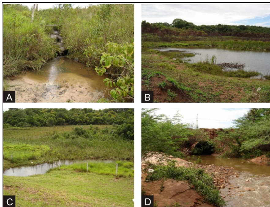
Figure 2. Sampling points of Córrego Vargem Limpa, Bauru (SP): A) Point 1, B) Point 2, C) Point 3, D) Point 4.