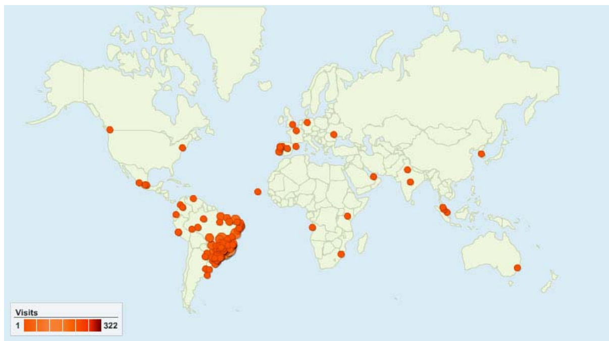
Figure 2. Spatial distribution of the 616 cities from where consultations to Ambi-Água originated in the two month period analyzed (June 15 on August 15, 2008).

The cities from where the most frequent hits came from (10 or more) are identified in Table 1.